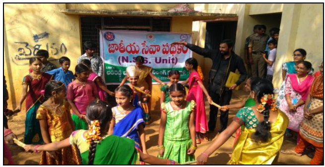
Children performing the programs